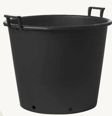
HEAVY DUTY CONTAINERS WITH HANDLES