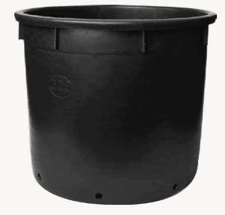
HEAVY DUTY CONTAINERS WITHOUT HANDLES