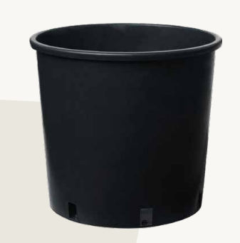
ROUND NURSERY POT